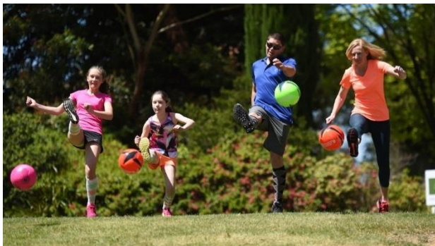
Previous ACG Recipient: Cardinia Beaconhills Golf Links

Sport development staff from Local Governments or Regional Sports Assemblies can provide advice on how to implement programs that will attract new audiences to your club