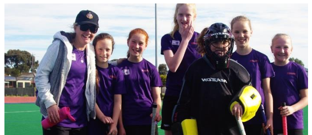
Previous ACG Recipient: Bellarine Hockey Club

We are available 9.00am-5.00pm Monday to Friday and aim to respond to all enquiries within 2 business days.