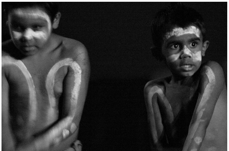
Gurunjan Budgers at Footscray Community Arts Centre.

At the end of each section, make a total of your scores. Look for the trends. For example, a project may be very strong on achieving individual and community outcomes but have very little impact on organisations. Use the results as a way of progressing or even re-focusing your project.