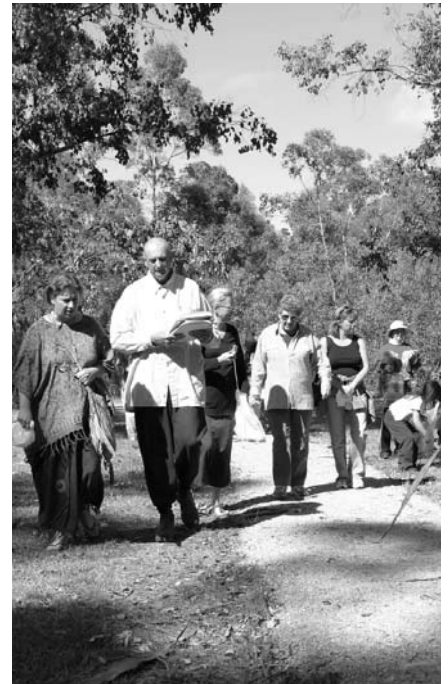
Creative Junction Project, Shire of Yarra Ranges.

A single mental health promotion initiative may not often be able to influence society as a whole. However, even small projects can sometimes make an important contribution to shifting a sector or policies that cross a range of contexts. Basic research in a new area can help create a public debate or inform policy development that is already under way. Such projects can advocate on behalf of a particular population group, or get an issue onto the public agenda. Major changes in policy seldom come out of the blue. They are normally the result of a series of smaller initiatives that exert an upward pressure on whole sectors and governments.