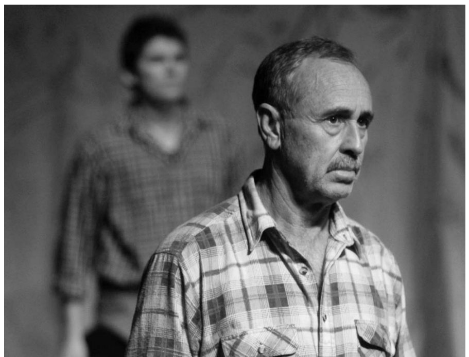
HotHouse Theatre's Wonderlands by Katherine Thomson.