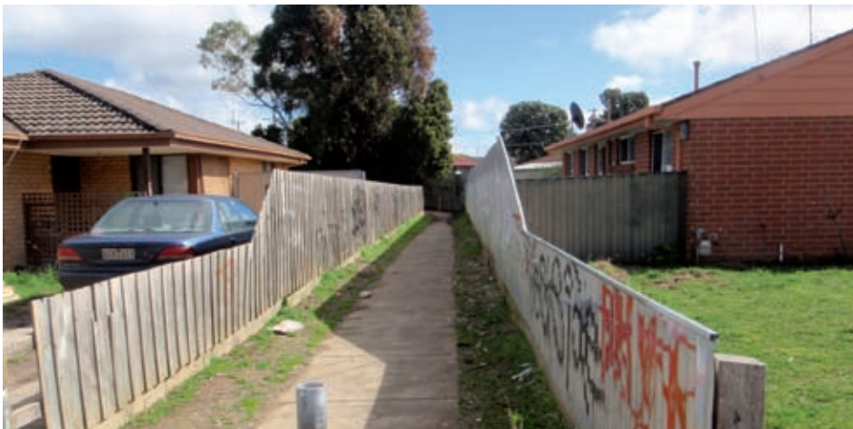
There is a large body of research on the impact of place, or where people live, on their physical and mental health.

Culture, personal characteristics and personal circumstances are moderating factors that, in many studies, appear to be more important than neighbourhood qualities in affecting health outcomes (Cutrona et al.; Pevalin, Taylor & Todd; Propper et al., cited in Foster et al. 2011).