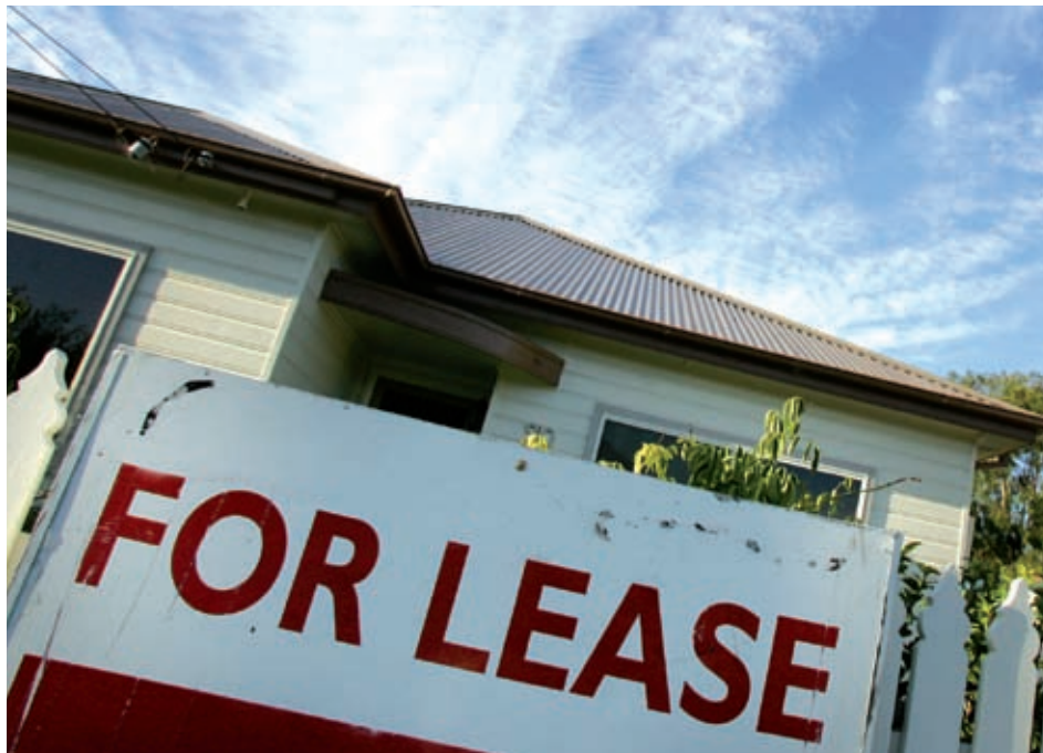
A wide range of research has found better health outcomes for home owners compared to renters.