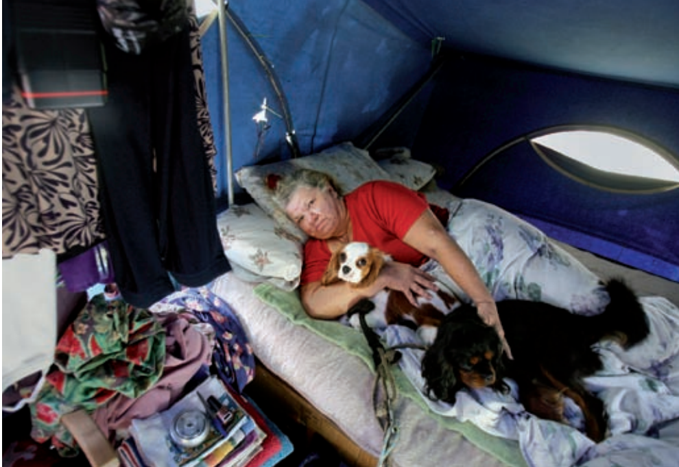
Homelessness affects living practices, such as the ability to access, store and prepare adequate food.