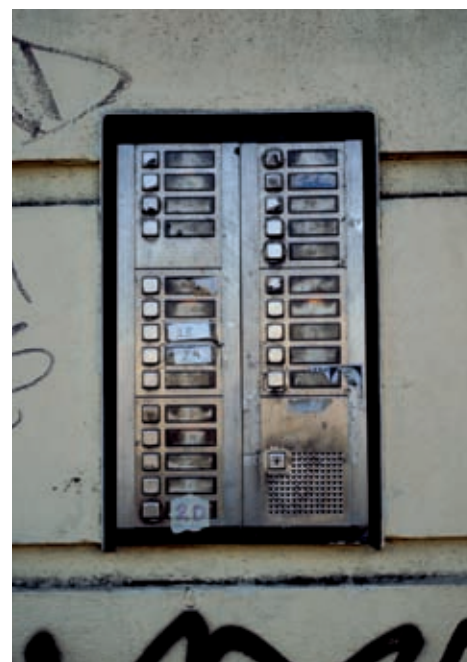
Crime rates affect real and perceived personal safety.