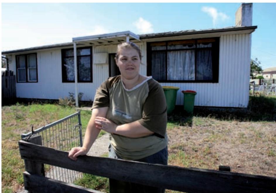
Neighbourhood qualities, personal characteristics and personal circumstances influence social connectedness, which affects mental health and wellbeing.