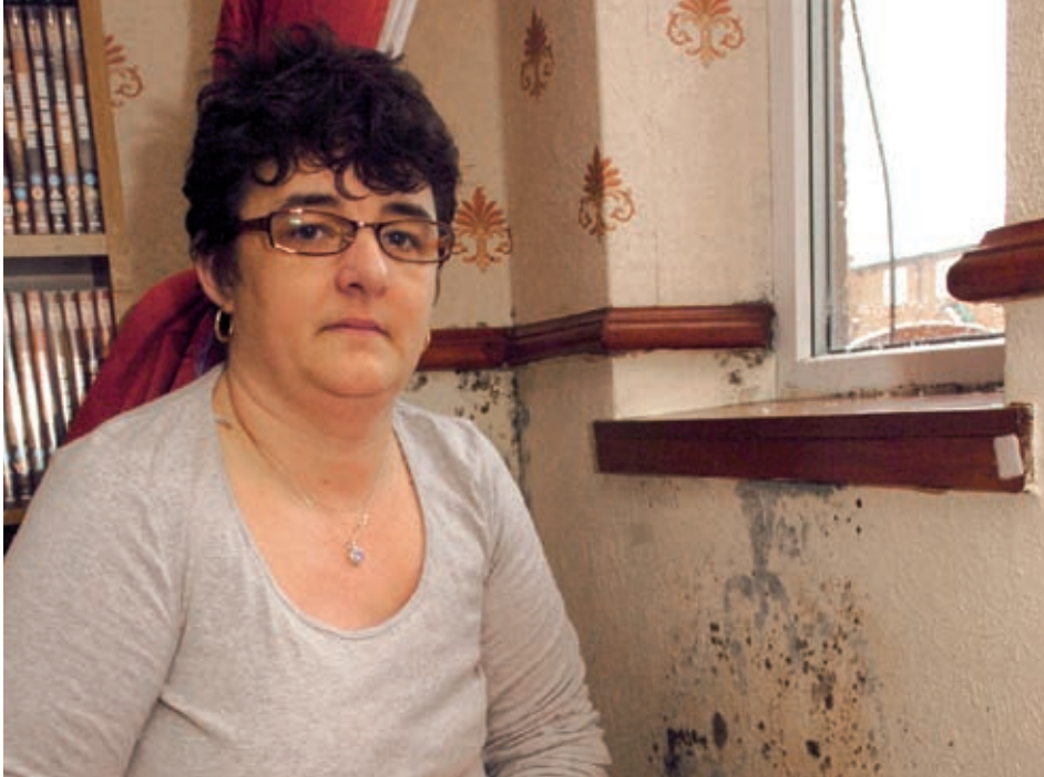
The indoor environment can be detrimental to people's health.