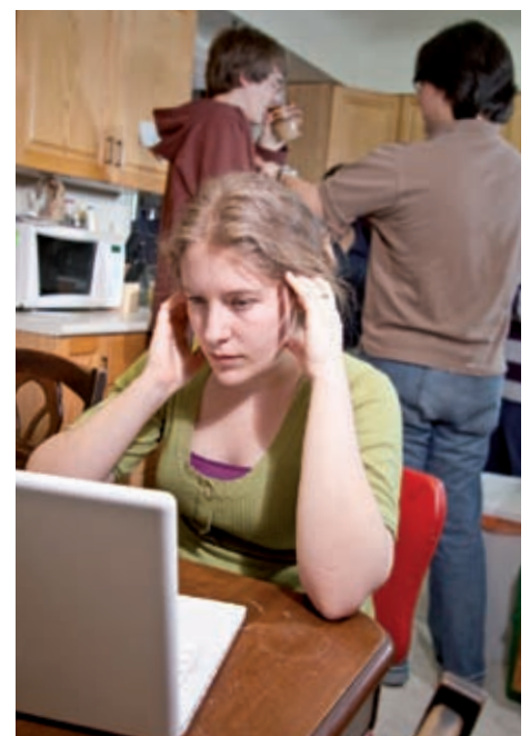
Lack of adequate space or control over space can affect mental health.