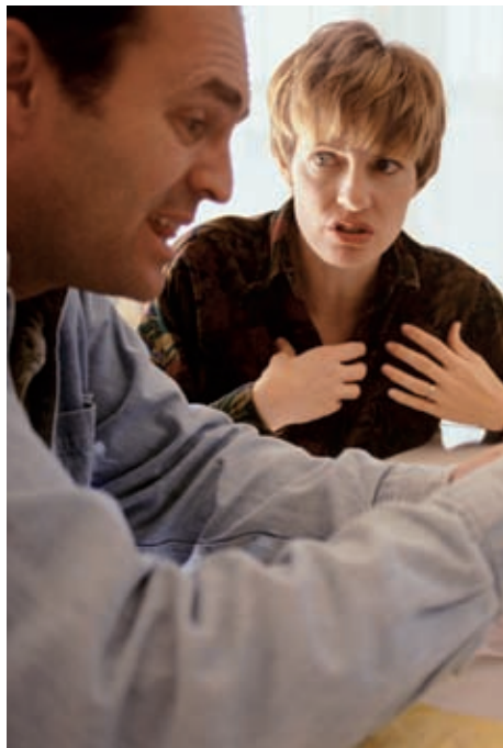
Housing affordability stress is prevalent across tenures in Australia.