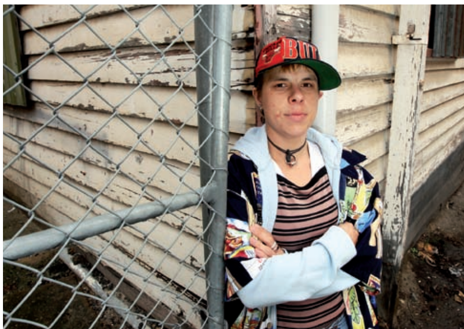
Housing that is in poor condition and/or unsafe is a contributor to poorer health.