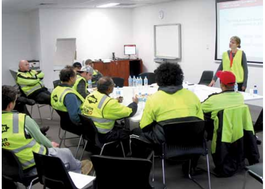
Lunch-time training sessions were provided for Linfox staff with a focus on 'bystander' action.

Take a Stand posters, magnets and brochures were developed to reinforce messages from the training component. These were widely distributed throughout Linfox worksites.