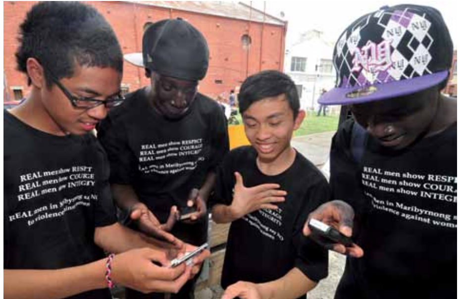
Respect and Equity involved people from all parts of the Maribyrnong community.

Respect and Equity, undertaken by Maribyrnong City Council, was the first initiative of its kind for the local government setting. The project sought to drive a comprehensive 'culture shift' agenda right across the functions and areas of Council so that gender equity, equal and respectful relationships, and non-violent norms become part of thinking, discussing and working in the organisation. To this end, the project targeted Council's core policy, planning, strategy, services, leadership and partnerships activity. This internal organisational work formed the essential foundation for the project to develop a