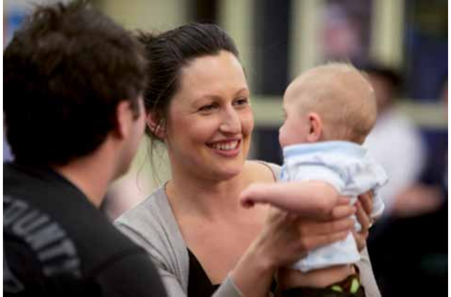
Many couples in the Baby Makes 3 program valued the opportunity to talk about equality in their relationship.

Couples acquired a language for discussing their experiences of parenthood, with some even putting in place actual changes in their day-to-day lives to ensure greater gender equality.