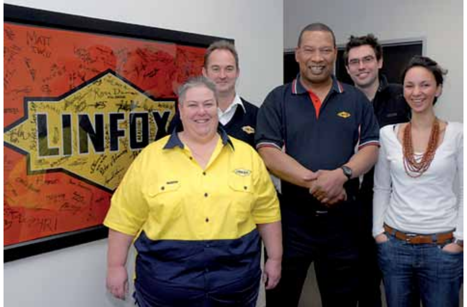
Women’s Health Victoria worked in partnership with Linfox worksites across Victoria.

Working Together Against Violence* was a partnership between Women’s Health Victoria and Linfox. It took place in Linfox’s operations in Victoria, including the Melbourne-based office. In 2010, Linfox had 40 different worksites across the state with nearly 2,000 employees, of whom 85 per cent were men. Meanwhile, Women’s Health Victoria had a staff team of around 20, all women.