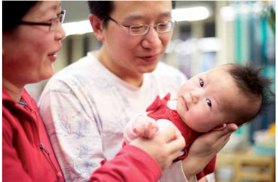
The Baby Makes 3 program involves first-time parents in discussion and activities.

The birth of a first child is often a major turning point in the lives of heterosexual couples as they take on new roles as mothers and fathers. Despite changes to notions of the family over recent years, such roles continue to be shaped by traditional gender norms and expectations about men and women in society, and the role of women in the home. While the transition to parenthood can be a time of great joy for many, it can also be marked by a diminishing of equality within couples accompanied by an assertion of rigid gender roles and identities. Programs that focus on lifestyle and relationship changes occurring at this time – from a gender equality perspective – can do much to build equal and respectful relationships and, by extension, protect couples from the risk of intimate partner violence occurring in their lives.