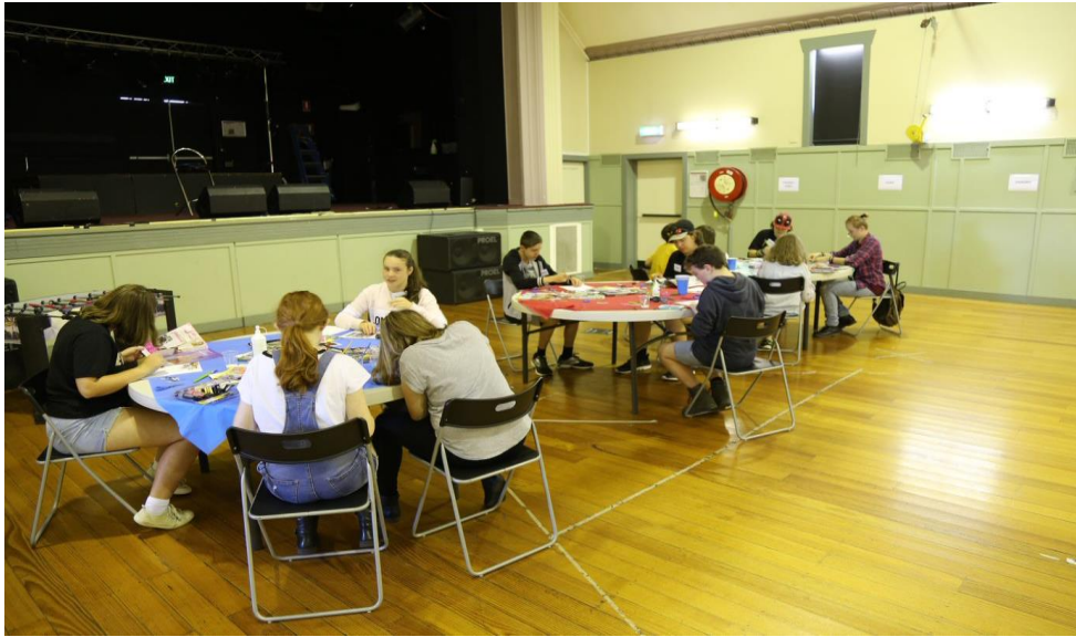
A still of a Story Collector

Story Collectors exploring identity and 'the self' in a collaging activity during Workshop 1, Maroondah City Council.