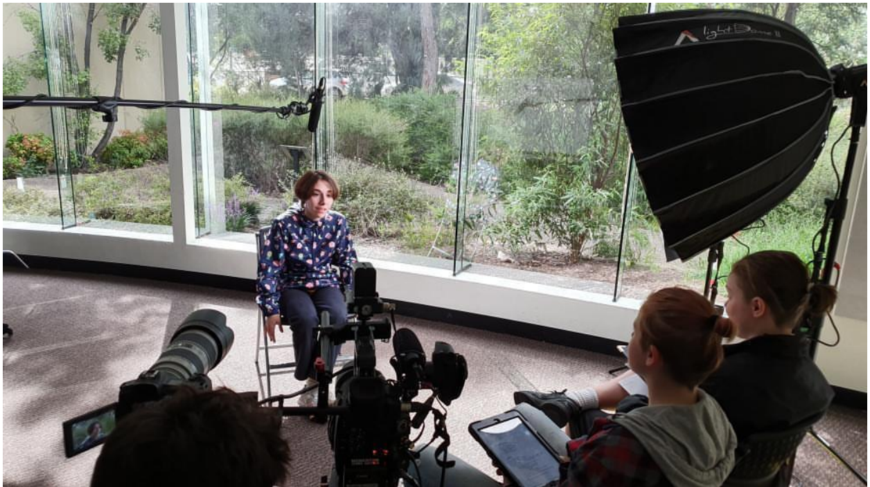
(Below) Story Collectors interviewing a Story Teller with the assistance of a professional production company, Maroondah City Council.