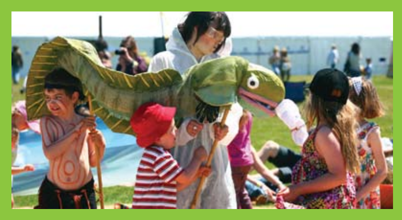
Community celebrations and festivals provide opportunities to reduce discrimination by increasing contact between people from different backgrounds as they work together towards shared goals.