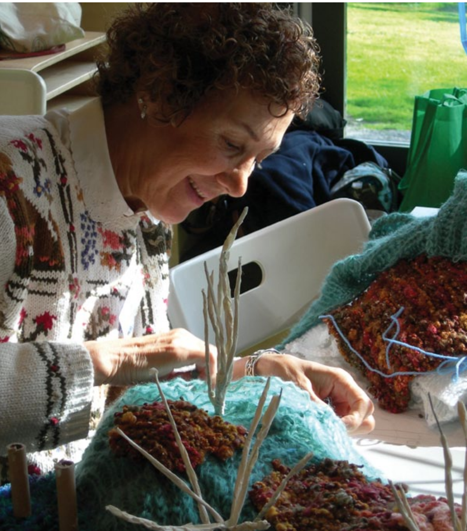
Homeland Kate Just (2007)