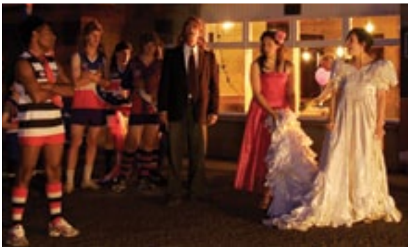
The (Aussie Rules) Taming of the Shrew The Old Van (2009)

Documentation can be done by a number of people, including participants, workers and artists. The project manager's job description should include collecting and archiving relevant documents. A photographer or video artist may be employed to capture aspects of the process including the special event. Allocate resources early for documentation.