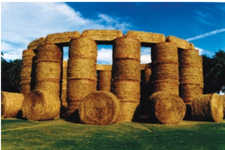
Balehenge. Art Is...Energy Festival (1998)