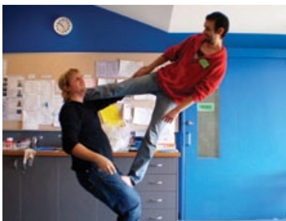
Barwon Valley School Circus (2009)