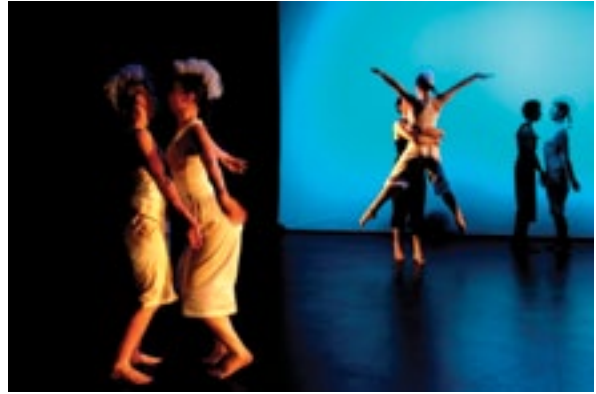
Embodied Dis/assemble Dance (2011)

The process usually starts with the parties sitting down together to talk through the issues and come to an understanding. If they are not able to do this, a facilitator or mediator can be brought in. This may or may not be someone participating in the project.