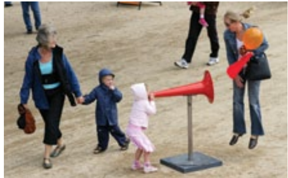
The Megaphone Project Anthony Nagle, FINA Festival (2007)

Chapter 7 covers resourcing and budgets in more detail.