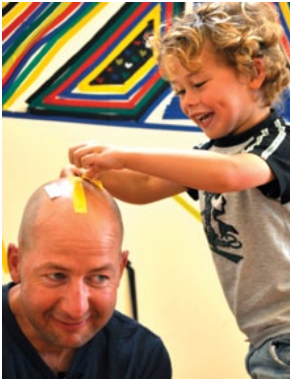
ArtPlay (2011)

An artist or group of artists can work with communities in many different ways. Artists have different skill sets and preferences. It is important that a clear job description detailing their role is developed based on information about the community, group or individuals involved and the desired outcomes.