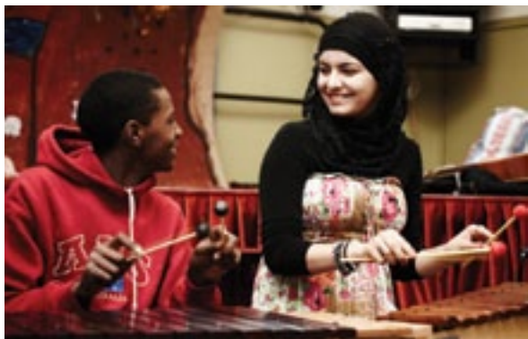
The Song Room (2011)

Other terms that might be used for a Code of Conduct are 'Code of Manners' or 'Job Description'. As the job description from the Women's Circus indicates, these documents can be very clearly and simply expressed.