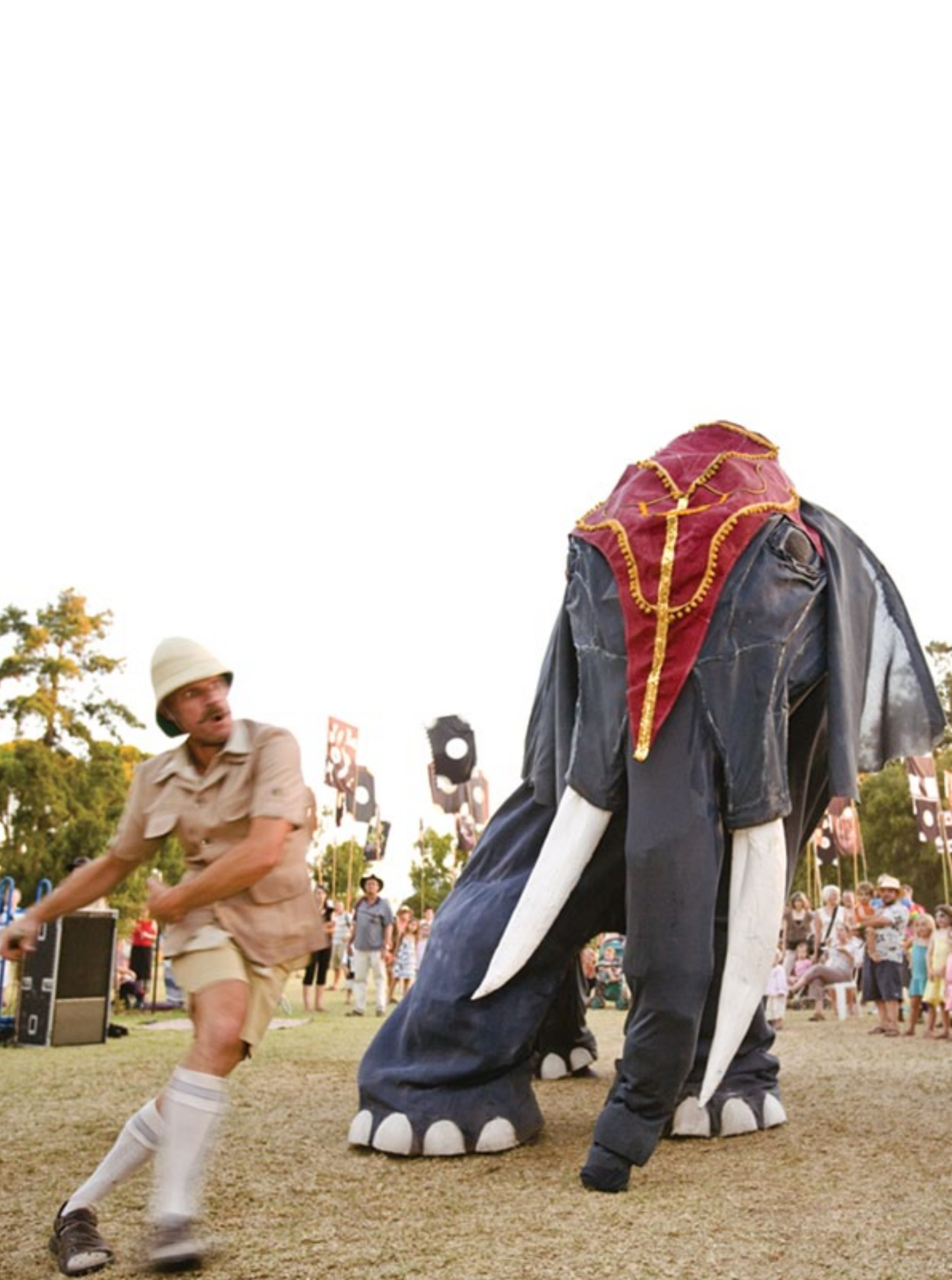
Snuff Puppets Roaming performance, Kareem the Elephant (2010)