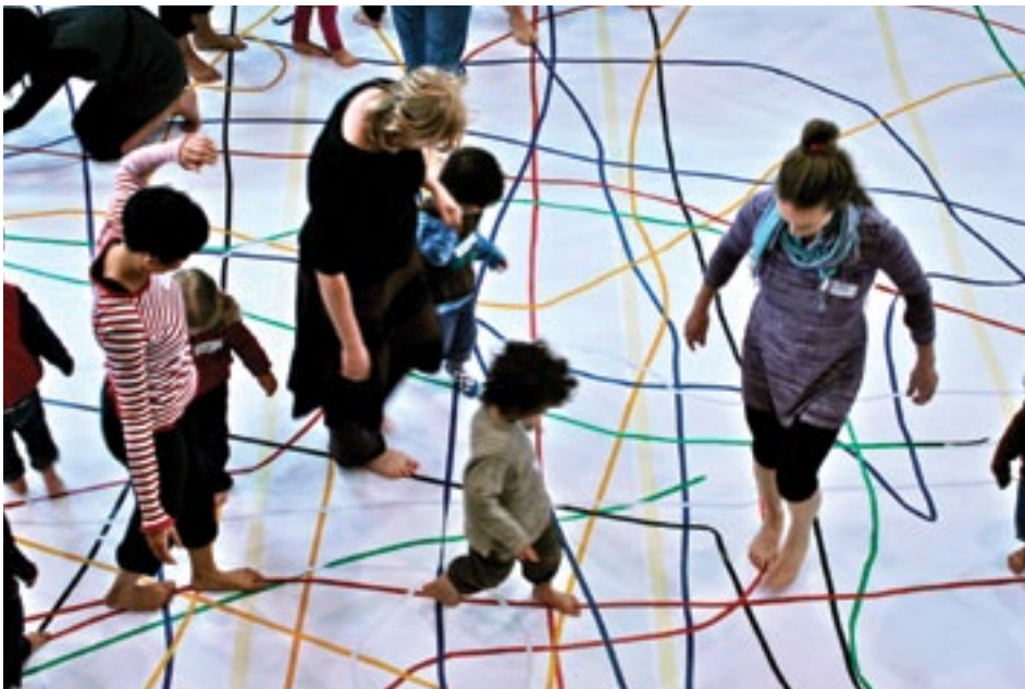
Activities at ArtPlay (2011)