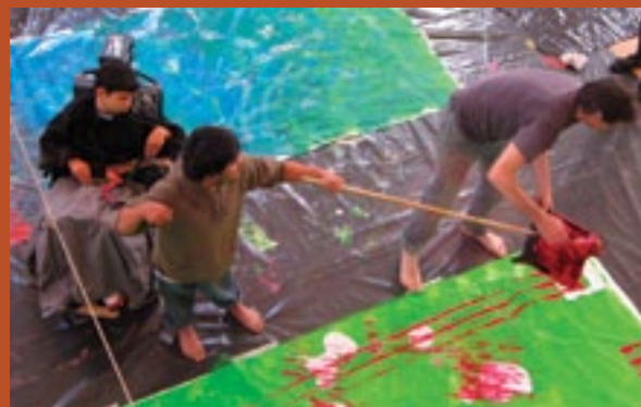
Yooralla Independent Living Centre Collaborative Art Project (2006/07)