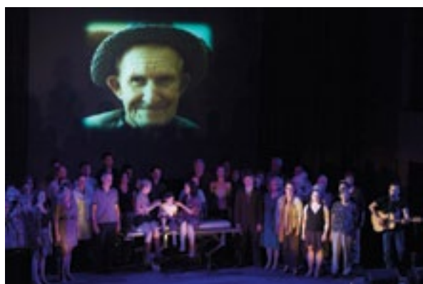
Dust Hubcap Productions with Regional Arts Victoria and Asbestos Diseases Society of Victoria (2008)