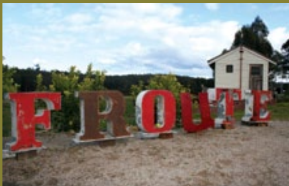
(f)route (2012)