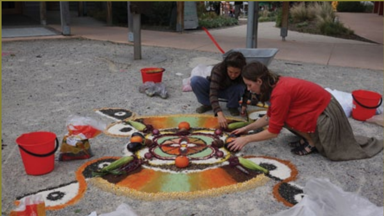
Making a seed mandala at CERES Harvest Festival