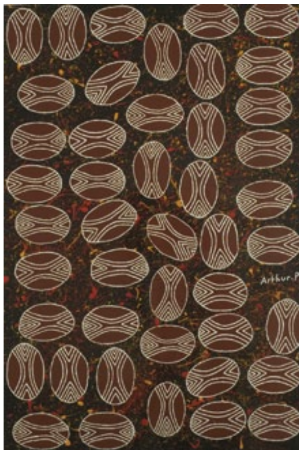
Gunai/Kurnai Tribal Shields Arthur Pepper-Dawes. Acrylic on paper (2008)

Protocols are a set of rules, regulations, processes, procedures, strategies or guidelines which help you work with people and communicate and collaborate with them appropriately. They are also standards of behaviour, respect and knowledge that need to be upheld. You might even think of them as a code of manners to observe.