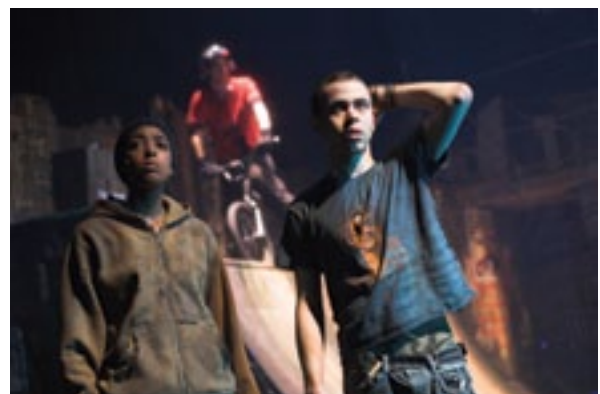
Skid Arena Theatre Company (2006)

Protocols and ethical considerations are made to empower the project and the community involved. They are the basis for proper interpersonal relationships that can provide the common ground upon which the project can be built.