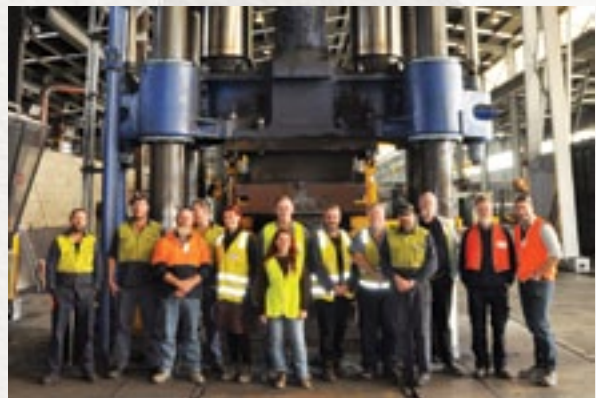
Blacksmiths from Overall Forge and the Australian Blacksmiths Association (Victoria)