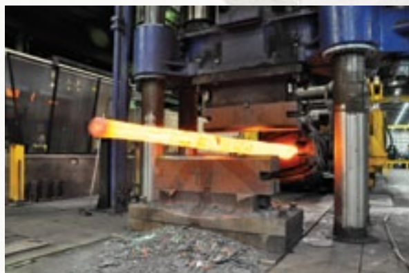
Trunk under the press at Overall Forge

Blacksmiths from over twenty countries have contributed to the Tree Project. The leaves are made by master blacksmiths, some by blacksmithing students and some by children. Amazingly, there are over three thousand of them. With so many leaves, the Blacksmiths needed a much larger support structure than originally assumed. Sinclair Knight Merz Engineering offered their services to engineer a tree that could carry all the leaves. Valley Community Bank Group and Bendigo Bank donated funds