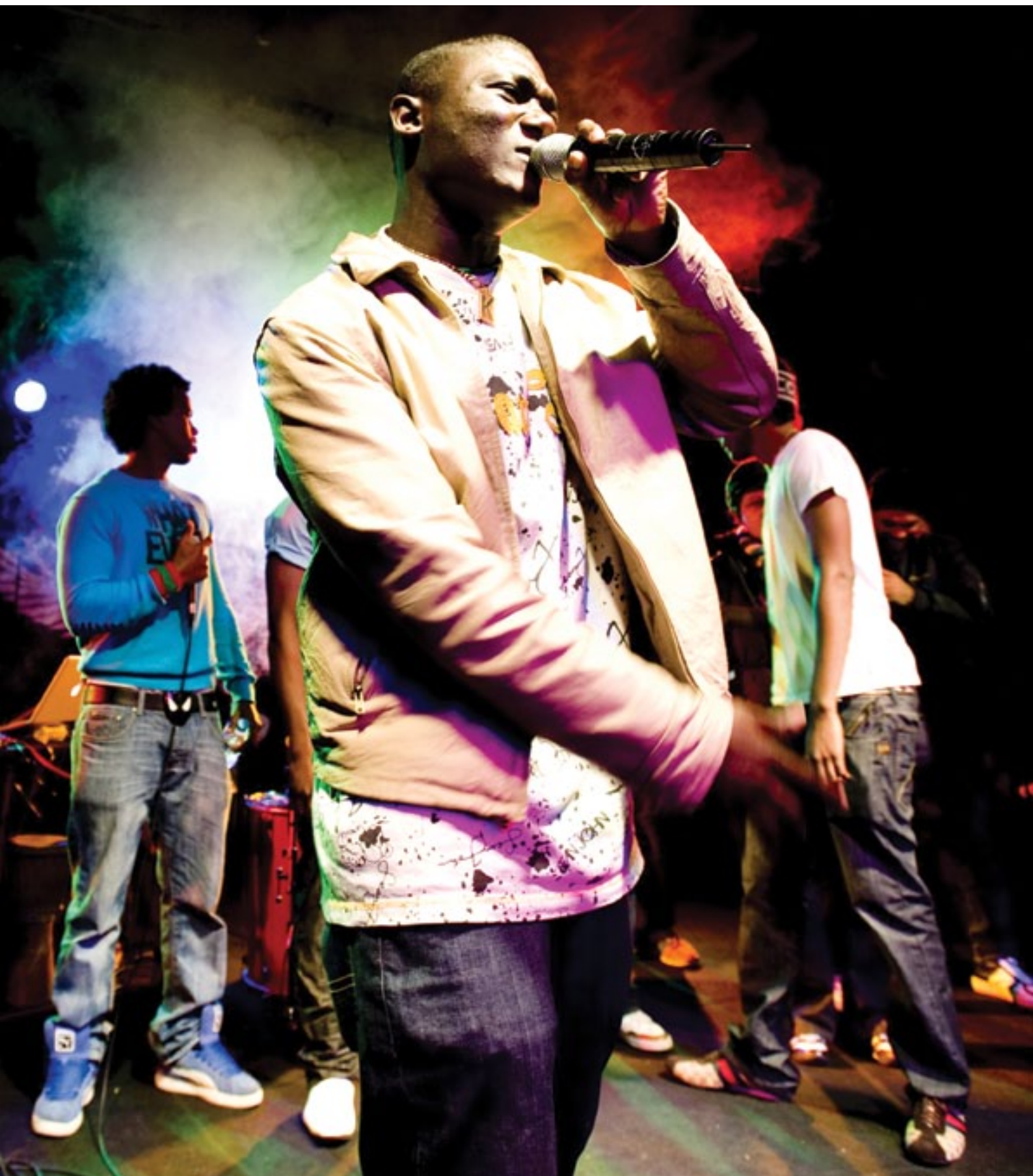
Visible Sessions Live at the Black Box as part of Mix It Up by the Arts Centre in Association with Multicultural Arts Victoria (2009)