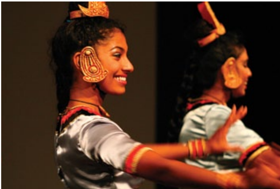
Fresh Dance New Beats Ausdance Victoria (2008)

Apart from the project's final report there may be additional reporting or promotions that need to be completed. Other organisations or people working in the field may be interested to see how the project worked. Prepare and send reports to other staff, websites, journals, newsletters or conferences.