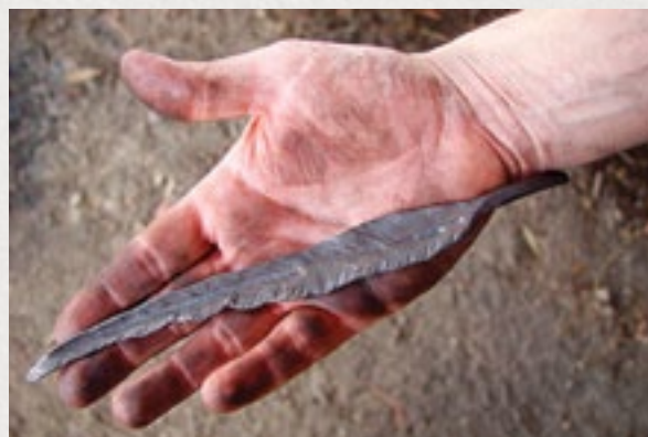
Cliff's hand (Steel leaf by Cliff Overton CFA)

The aim is that the tree will provide a place of reflection and contemplation for those who have suffered terrible loss. The tree has become an expression of empathy and solidarity among those in the fire-affected communities, across Australia and from around the world. It is a symbol of admiration and hope for the spirited people who are recovering and rebuilding to stand for generations to come.