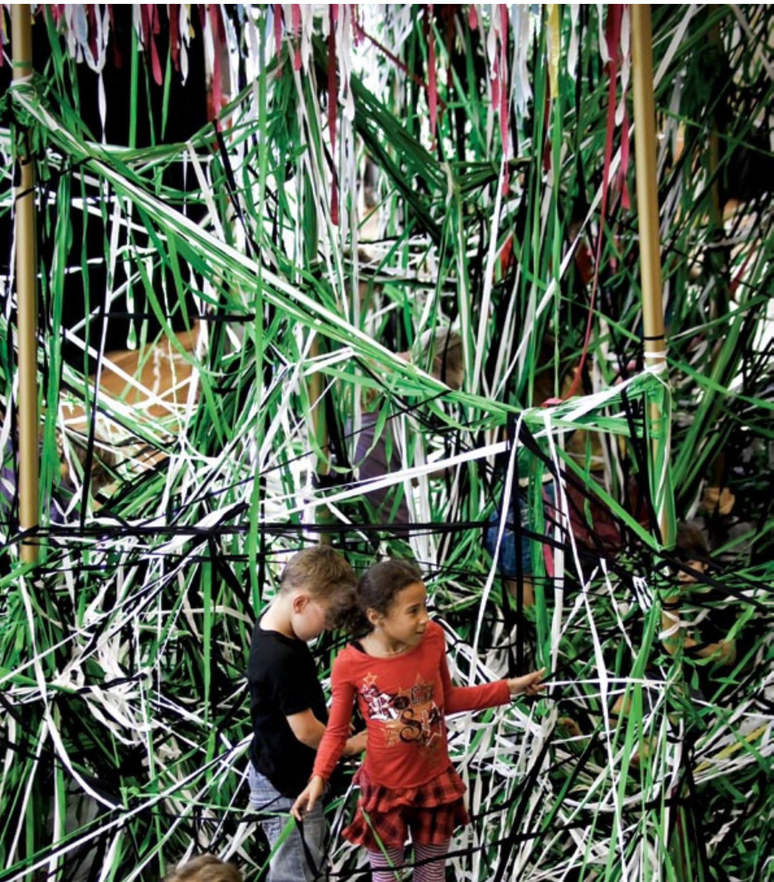
Tangle Polyglot Theatre (2011)