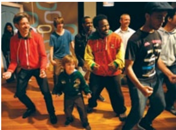
Chronicles: Searching for Songlines Western Edge Youth Arts (2010)

Arts and community projects occur in many contexts and can raise community awareness about many issues, including health promotion, environment and sustainability, urban renewal, rural revitalisation, cultural planning, community strengthening, social inclusion and cultural diversity.