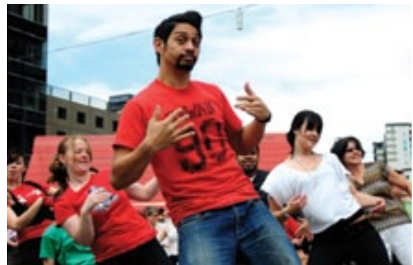
Melbourne Fringe Festival Crowd Play 2 (2011)

Funding bodies and partners require different levels and forms of reporting and documentation and the internal report can provide the basis for these. Always leave enough time and resources at the end of a project to be able to complete this process effectively. Often the time it takes to wrap up the project and prepare, write and disseminate the reports is underestimated.