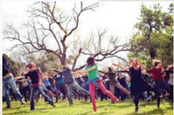
Melbourne Fringe Festival Crowd Play 1 (2011)