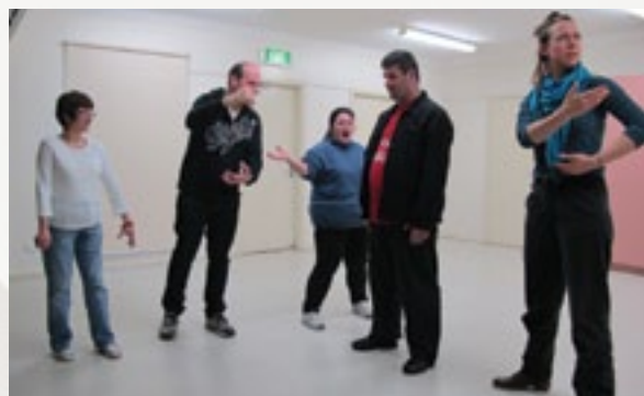
Exploration of gestural and neutral poses Way out West performance workshop (2012)

Arts Victoria and the Office for Disability have been working as successful cross government partners to address barriers and identify strategies for increasing access to the arts for artists and audiences across Victoria. Arts and Disability Action Plan Training (ADAPT) is an innovative approach to increasing the participation of people with disability in arts and cultural life in Victoria. ADAPT is a result of a cross government partnership between Arts Victoria (Department of Premier and Cabinet) and the Office for Disability (Department of Human Services) and the Picture This research, which aims to increase access to the arts in Victoria for artists and audiences with disability. Arts Victoria and the Office for Disability commissioned Arts Access Victoria, the State's key arts and disability peak body, to develop ADAPT.