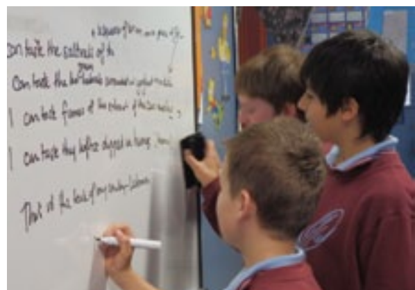
Belonging Identity and Home Mossgiel Park Primary School (2012)

Have a flexible framework with key goals. Do enough planning so the facilitating team (and support networks) know the main agendas of the project. The project plan should remain flexible enough so a dramatic shift can be made (which can often be the case) without jeopardising the project itself. The more you know a group, the more prepared you can be. Always bring the group along with you and don't dictate how the project is planned. Facilitate sessions so they have input into the direction of the project.