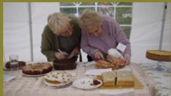
CWA ladies judging the cake competition at CERES Harvest Festival

CERES is a place for people to come and connect to the natural environment and an appropriate place to explore our social and cultural relationship to community, arts and landscape.