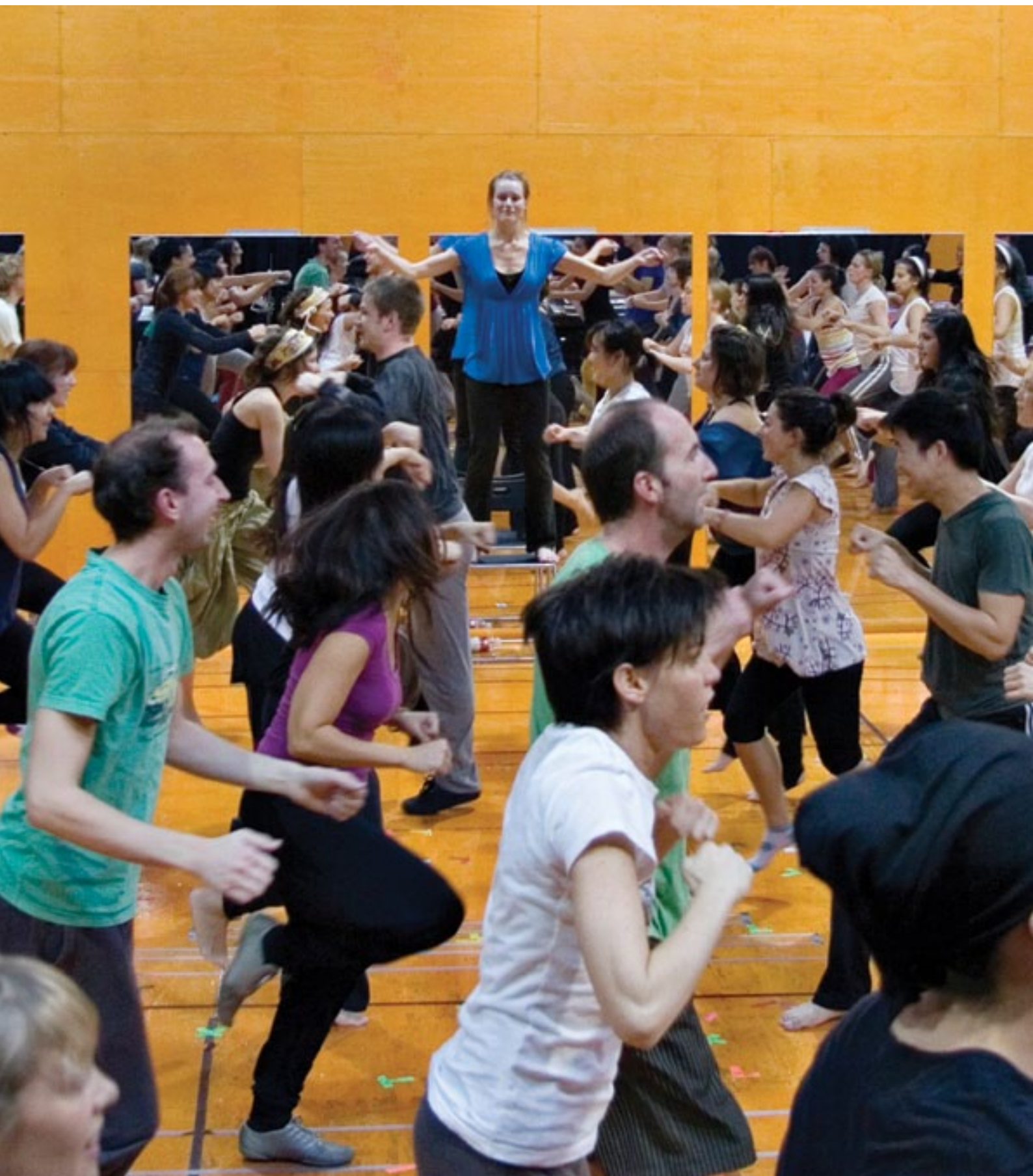
Moving One Hundred rehearsal Australian Dance Awards Public Program (2009)