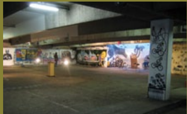
AURA (2011)

In addition to various local uses, many people visit for events associated with the Fringe Festival, Northern Melbourne Institute of TAFE (NMIT), Victorian College of the Arts (VCA) and the Royal Melbourne Institute of Technology (RMIT), enlivening and integrating this part of the estate with the broader community.