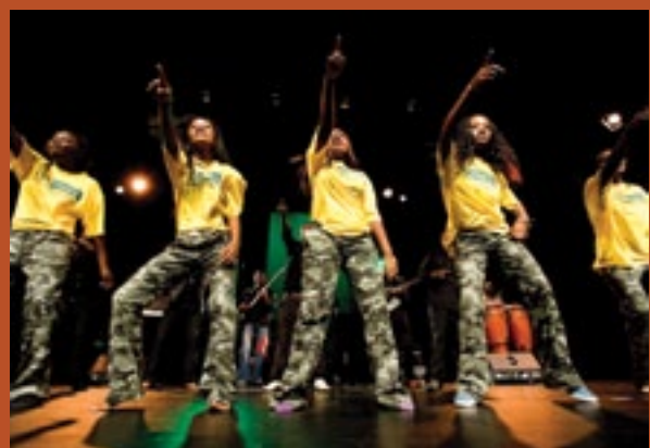
Angel's Voices Shepparton (2009)