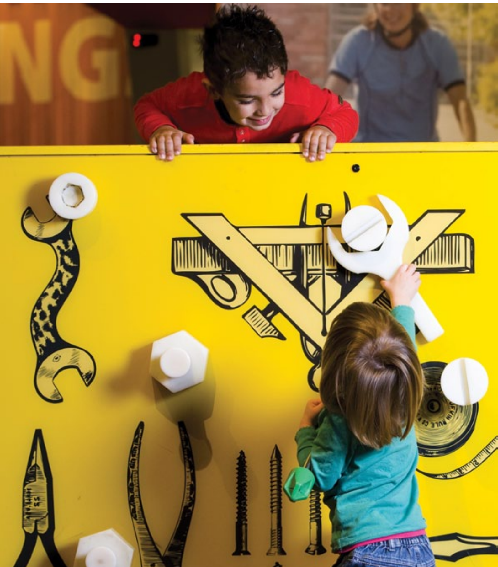
Scienceworks Museum Victoria (2010)