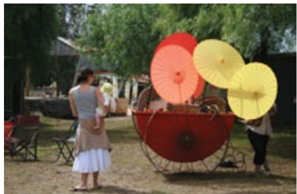
(f)route Penny Carruthers Cassilis/Swifts Creek (2012)