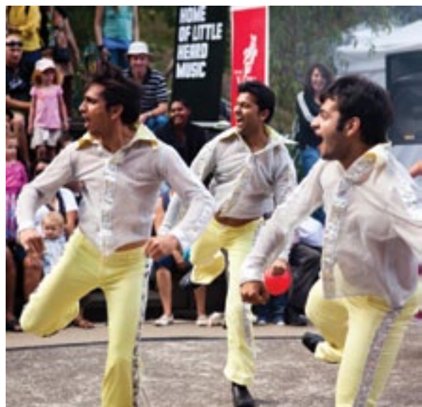
Black Harmony Gathering (2010)

When working with communities you need to be very clear about who owns the work produced throughout the project. If an individual creates the work they can retain copyright and grant the project use of it for a specific time or purpose. There are exceptions to this, however. For example, if it is commissioned work or a work created during the course of employment, copyright may be retained by the commissioner or employer.