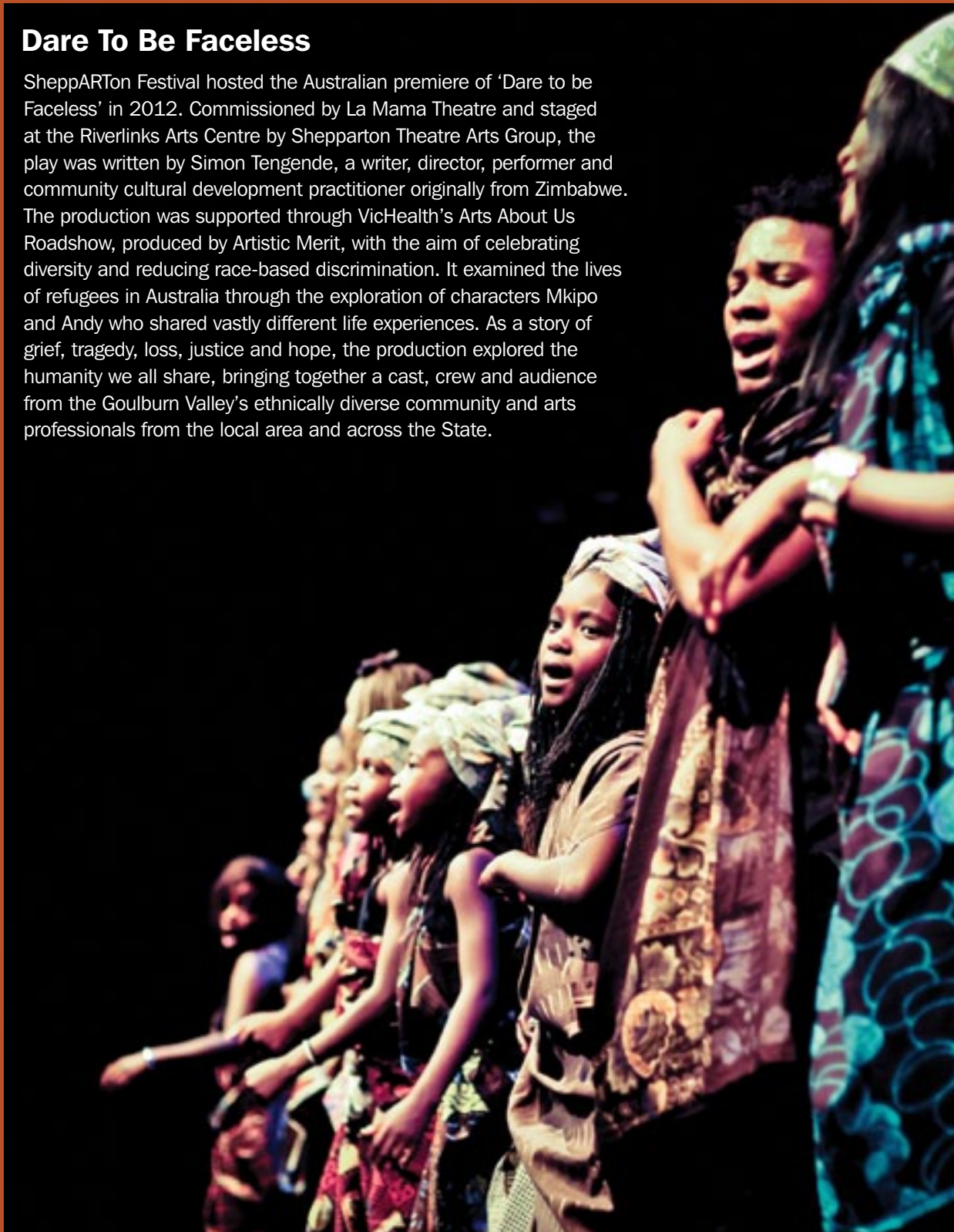
Dare to be Faceless (2012)