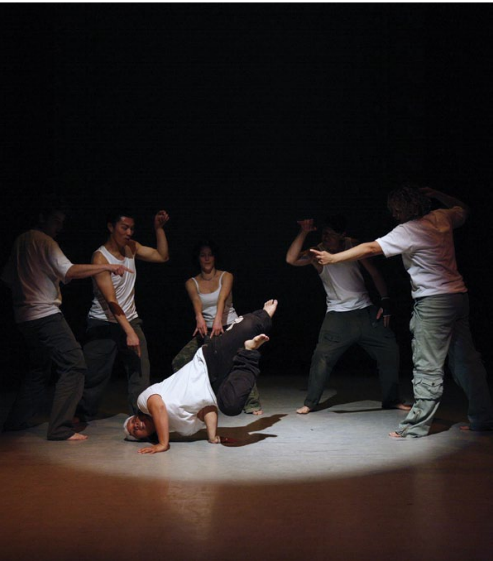
Deaf Can Dance Deaf Arts Network, Arts Access Victoria and Phunktional (2009)