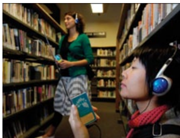
A-Lure Visionary Images (2008)

Good Starts Arts – Run by the Refugee Health Research Centre at La Trobe University and funded through an Australian Research Council Linkage Grant in partnership with VicHealth and the Victorian Foundation for Survivors of Torture (Foundation House)