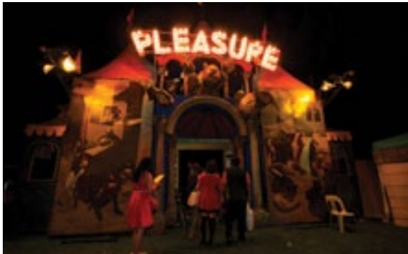
The Village (2013)