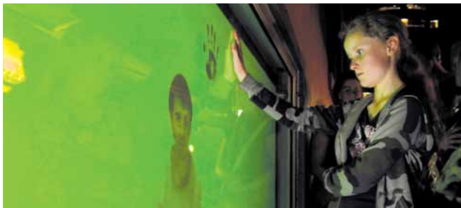
Game player interacting with 'Touch', Melbourne 2008.

Information communication technologies provide many new and exciting opportunities for creative initiatives that promote participation, social connection and community engagement, which have positive health and wellbeing outcomes.