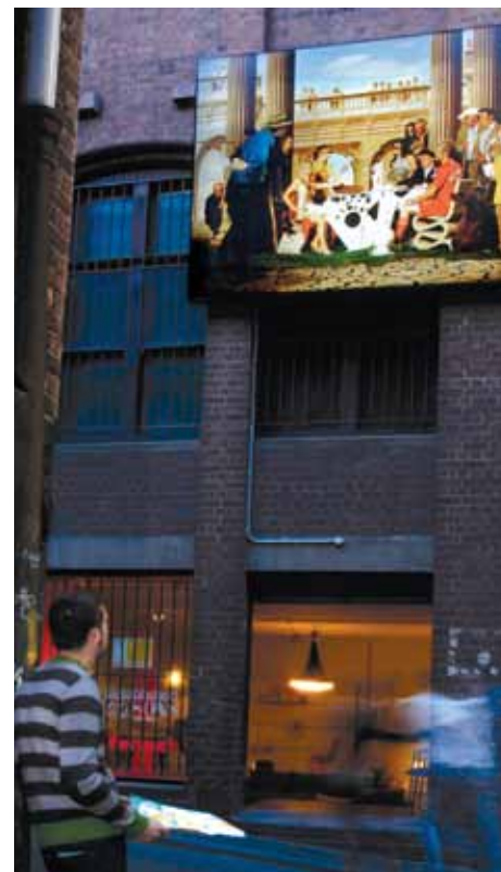
Higson Lane, Melbourne – 'The Banquet' light box.

The Travelling Chair is a web/mobile phone application for people with disabilities that will allow people to create personal profiles and review venues. This will create an interactive social network that provides essential information on the accessibility of buildings and venues across Victoria.