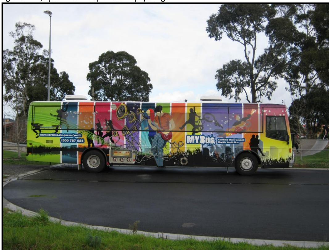
Figure 2: The Cardinia Shire MyBus

Young people access the laptops mostly to access Facebook, YouTube, play games and to research information for school assignments as they may not have internet access at home. Anon 4