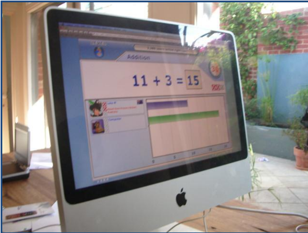
Figure 4: A game of Mathletics being played live

Researcher: Your son has created a blog?