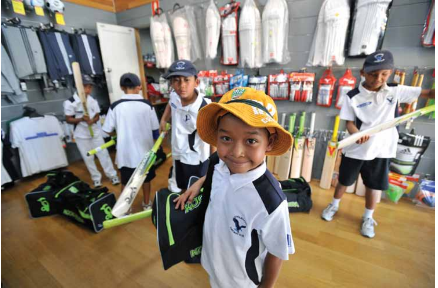
Karen refugee children being kitted out for the game by local business after asking if they could be helped to play cricket.