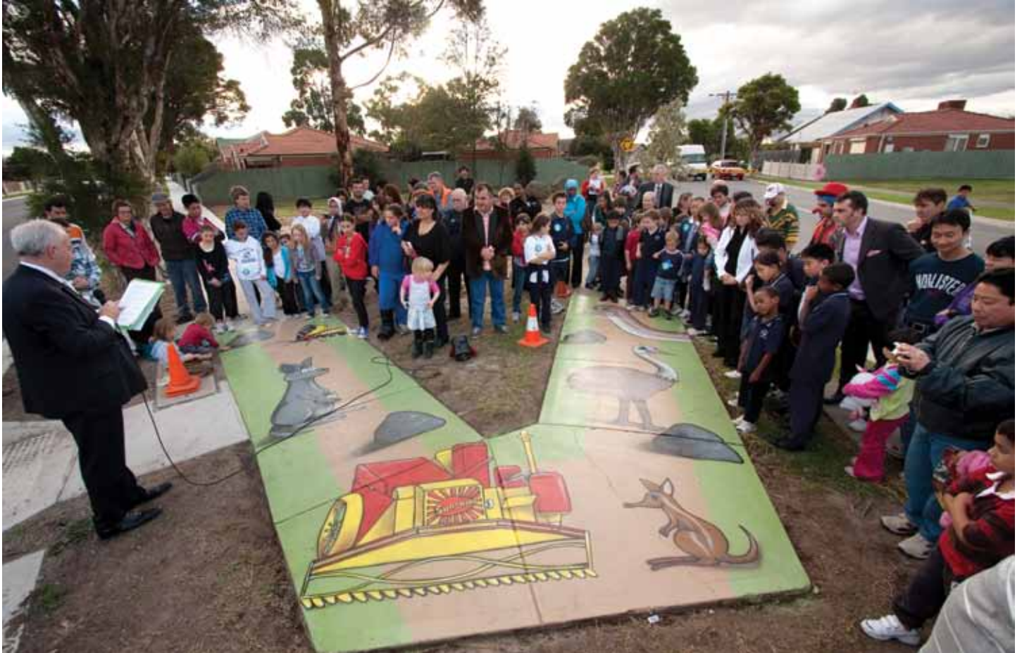
The unveiling of the first Footloose Footpath at the Walk Safely to School Day event, May 2010.