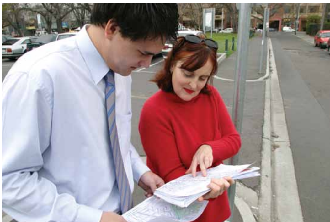
Streets Ahead Local Action Committees worked with council transport and road safety areas to plan and implement infrastructure changes such as improving bicycle paths, especially around schools.

The case studies that follow illustrate some of the successful and innovative approaches taken to overcome barriers and make a difference to children's physical activity.