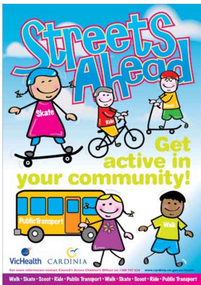
One of the promotional posters showing the five modes of active travel developed by Cardinia Shire Council.

The aim of Streets Ahead was to create supportive environments that increase children's active travel and independent mobility in all aspects of their local community life.