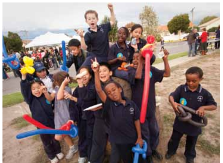
Participants enjoying Walk Safely to School Day which encouraged the local community to reclaim neighbourhood street spaces as pedestrian-friendly and social zones.