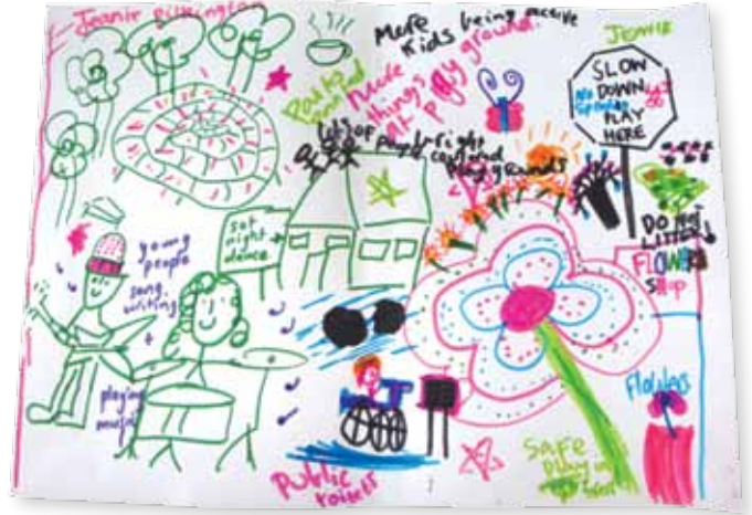
A young participant's vision of a child-friendly neighbourhood.

Interested participants from the workshop became part of the Neighbourhood Action Committee. With the support of Streets Ahead this group transformed into an independent and active community organisation – the Albion and Ardeer Community Club. Club members developed their own shared and holistic vision for their neighbourhood that linked ecological, social and physical health and wellbeing.