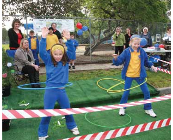
To raise awareness about access to green public spaces and reducing dependency on cars, Preston Primary School held two PARKing Day events where metered car spaces were replaced with 'parks' for the day.

The Streets Ahead project focused mainly on direct participation programs for school children, while assisting schools in future planning and integrating Streets Ahead aims into local council's core business.