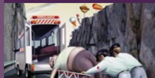
COVER

VicHealth news, funding opportunities, publications and seminars.