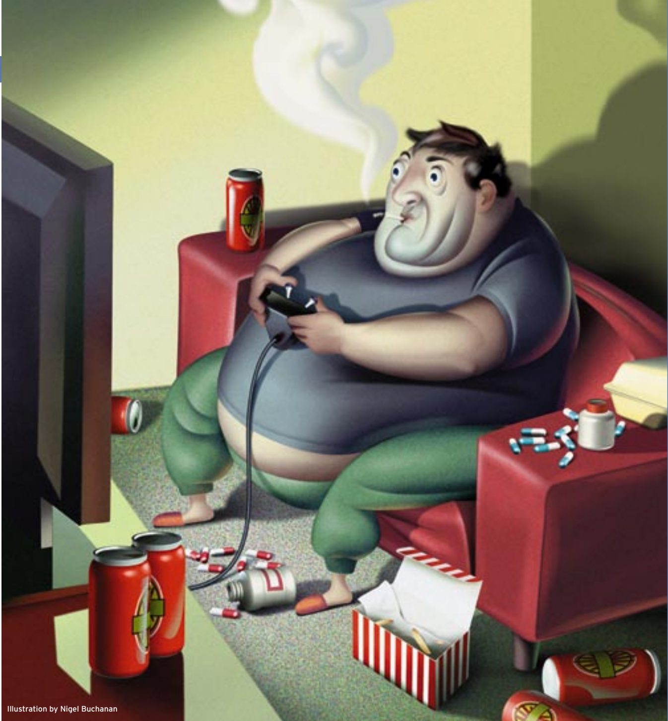
Illustration by Nigel Buchanan

of money. “Government can choose to be the biggest advertiser in the country. But what it needs is a climate in which it can both highlight a problem and promote solutions that people are ready to take seriously,” Mr Howcroft says. 8